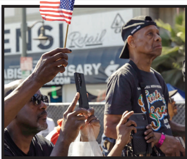
The crowd at the "A Taste of Soul" event in South Los Angeles on Oct. 19, 2024.